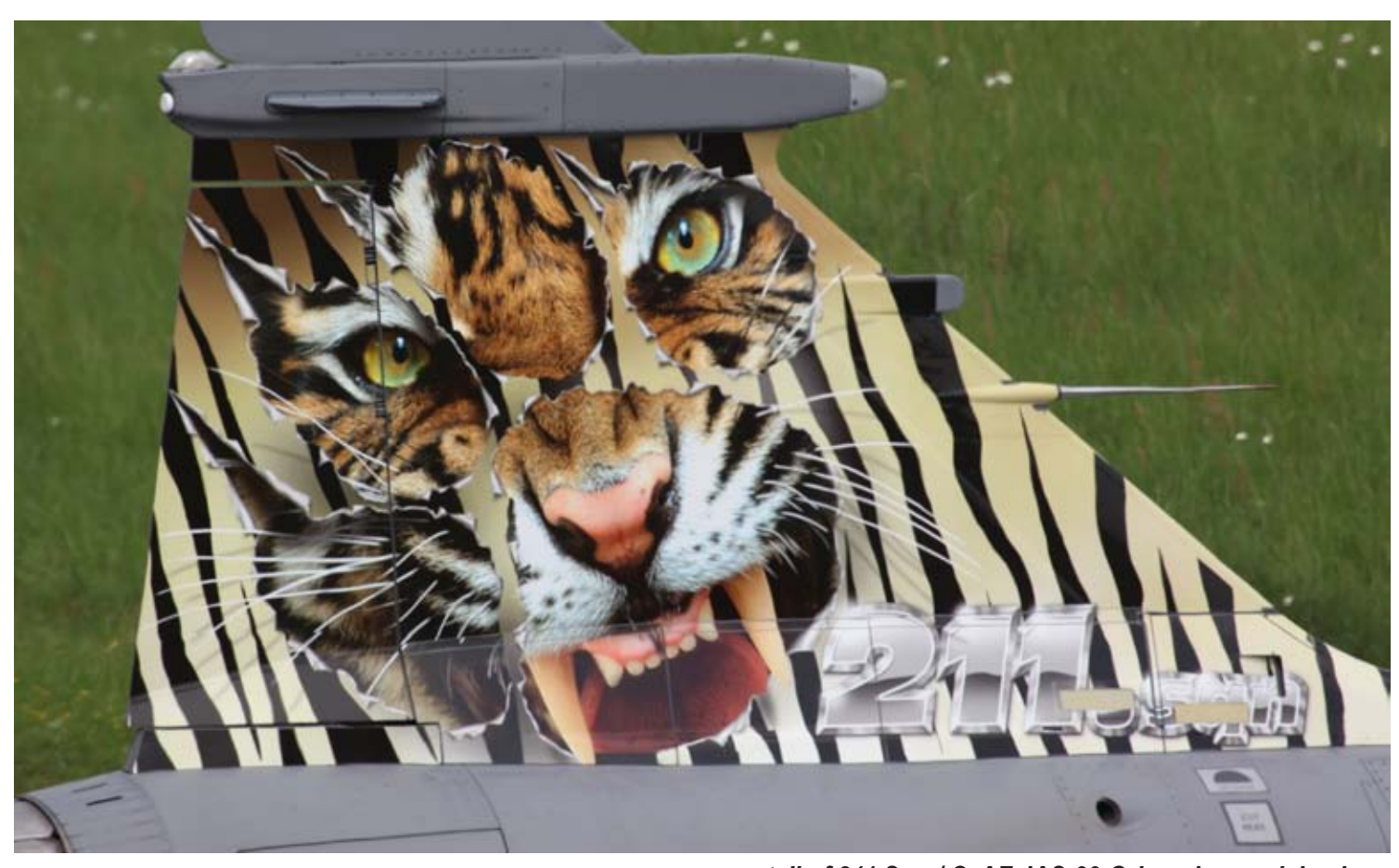
tail of 211 Sqn / CzAF JAS-39 Gripen in special colour.

organises the whole logistic and operational details. This is a particular strength of the exercise, because all participating squadrons can come up directly with their special needs for training during the planning phase without going through the whole chain of command between nations and staffs. On the other side a Fighter squadron also depends on support from external units and cannot always communicate from their level of command directly with other branches in the armed forces. That is when I start to enter the play as an exercise director. My task is to be the direct link between the squadron, the headquarters and the supporting units with respect to operational and logistical matters."