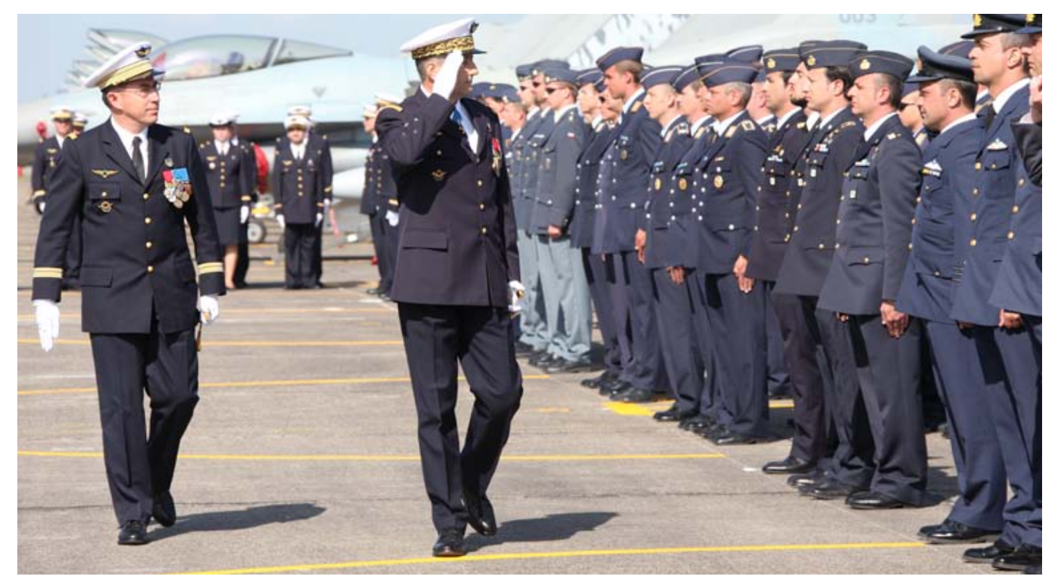
Général de Corps Aérien H. Hendel at anniversary celebrations.

organises the whole logistic and operational details. This is a particular strength of the exercise, because all participating squadrons can come up directly with their special needs for training during the planning phase without going through the whole chain of command between nations and staffs. On the other side a Fighter squadron also depends on support from external units and cannot always communicate from their level of command directly with other branches in the armed forces. That is when I start to enter the play as an exercise director. My task is to be the direct link between the squadron, the headquarters and the supporting units with respect to operational and logistical matters."