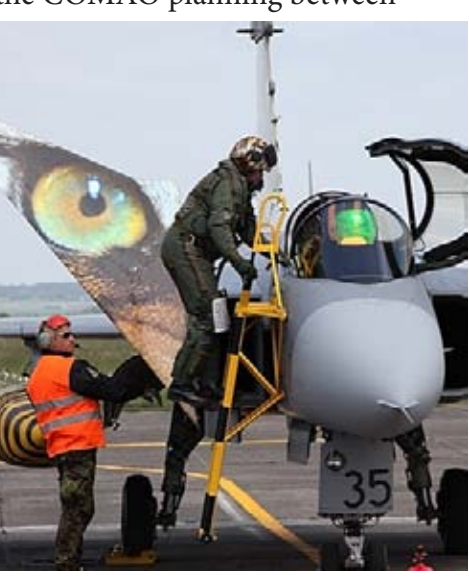
Gripen Pilot of 211 SQN CzAF

Their main task was to coordinate the COMAO planning between