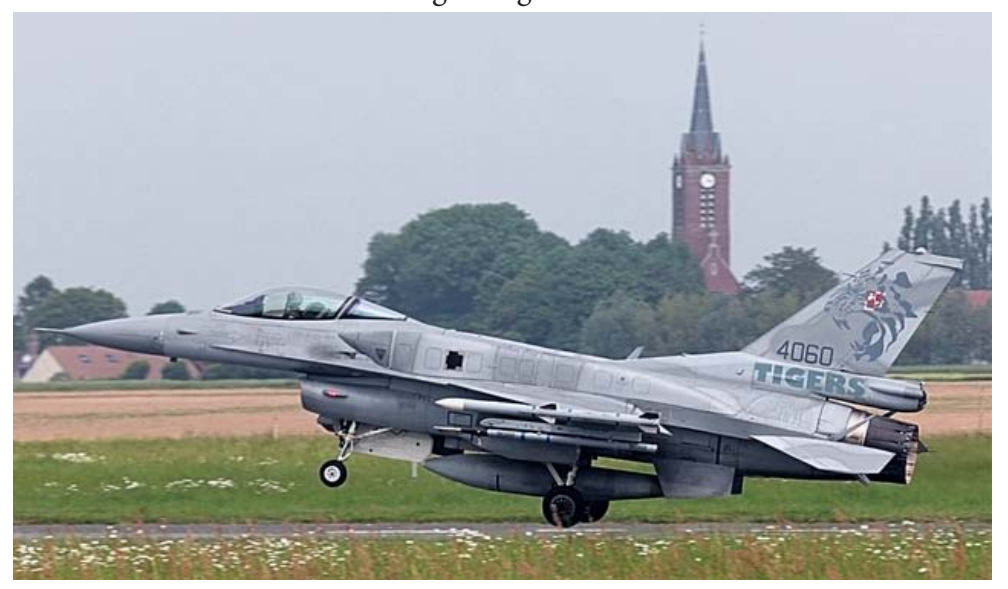
Polish F-16 from Poznań-Krzesiny

Cambrai - The majority of NTA member squadrons showed up at the home of Escadron de Chasse 01.12 "Cambresis" despite the ongoing operations over Libya, where quite some Tiger Squadrons are involved. The French authorities had to cancel a series of other exercises, but managed to save the NATO Tiger Meet (NTM). Out of 24 tiger squadrons from 18 nations that had been planned for the exercise, 20 squadrons attended the Meet, some even just for one week or the weekend like the Spanish Tigers. Even so, over 60 aircraft joined the exercise together with more than 900 aircrews and technicians for the conduct of Composite Air Operations (COMAO) over France, Belgium, Netherlands and Germany. It was already the 7th time that EC 01.12 organized the NATO Tiger Meet (NTM) at Cambrai. For the first time a Polish tiger squadron participated on a NATO Tiger Meet with 6 F-16C/D (Block 52+) of the 6th Eskadra Lotnictwa Taktycznego (ELT) from Poznań-Kresiny. The Tiger Assembly voted 6 ELT into the NTA as probationary members. Also, full membership was given to 335 Mira (SQN) Hellenic Air Force from Araxos / Greece after some years as a probationary member. For the first time they brought their new F-16C/Ds after converting from A-7E Corsair II in 2008. Another well received participant was NTA honorary member 1 SQN from Sliac in the Slovak Republic with 2 MiG-29 that flew a few missions at the beginning of the second week.