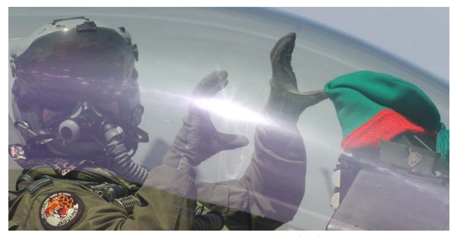
Pilot of 301 SQN from Monte Real shows tiger claws.