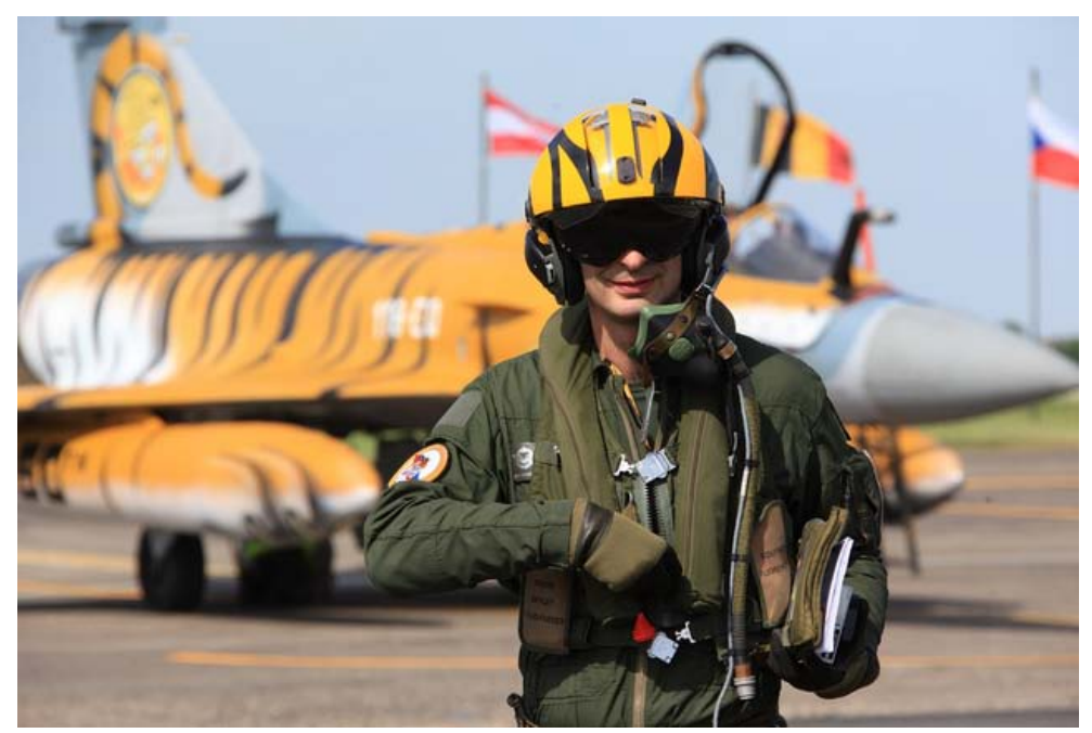
Mirage 2000 Pilot in front of his aircraft.

Cambrai - The majority of NTA member squadrons showed up at the home of Escadron de Chasse 01.12 "Cambresis" despite the ongoing operations over Libya, where quite some Tiger Squadrons are involved. The French authorities had to cancel a series of other exercises, but managed to save the NATO Tiger Meet (NTM). Out of 24 tiger squadrons from 18 nations that had been planned for the exercise, 20 squadrons attended the Meet, some even just for one week or the weekend like the Spanish Tigers. Even so, over 60 aircraft joined the exercise together with more than 900 aircrews and technicians for the conduct of Composite Air Operations (COMAO) over France, Belgium, Netherlands and Germany. It was already the 7th time that EC 01.12 organized the NATO Tiger Meet (NTM) at Cambrai. For the first time a Polish tiger squadron participated on a NATO Tiger Meet with 6 F-16C/D (Block 52+) of the 6th Eskadra Lotnictwa Taktycznego (ELT) from Poznań-Kresiny. The Tiger Assembly voted 6 ELT into the NTA as probationary members. Also, full membership was given to 335 Mira (SQN) Hellenic Air Force from Araxos / Greece after some years as a probationary member. For the first time they brought their new F-16C/Ds after converting from A-7E Corsair II in 2008. Another well received participant was NTA honorary member 1 SQN from Sliac in the Slovak Republic with 2 MiG-29 that flew a few missions at the beginning of the second week.