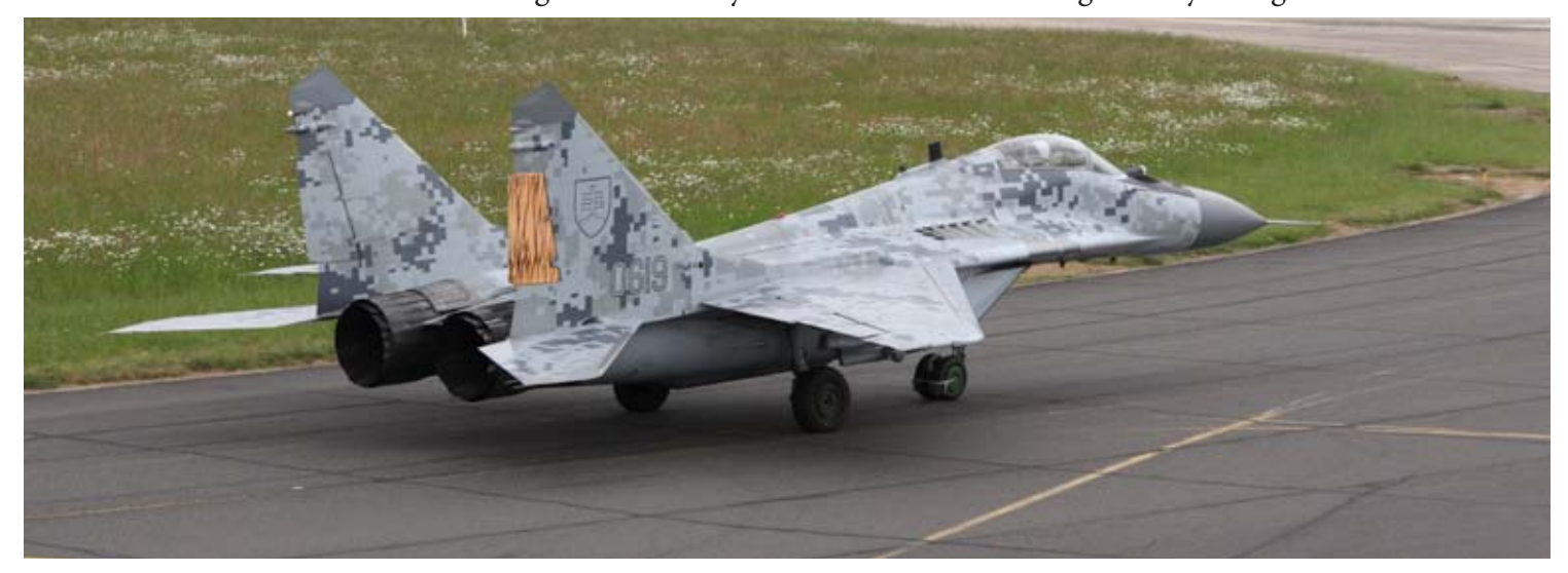
MiG-29's of 1 SQN from Sliac in Slowac Republic flew also a few Missions