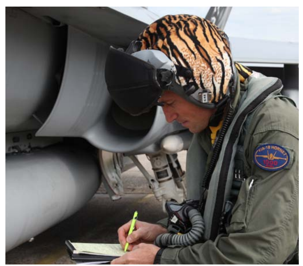
Swiss Hornet Pilot after mission.