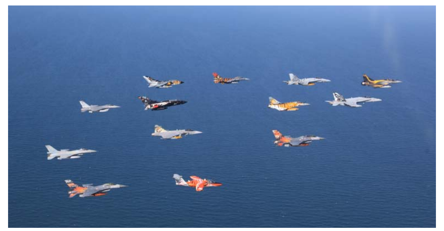
slow moving aircraft, various types of scenarios were offered in the exercise play. One major point of focus was the integration of helicopter forces into the fast jet scenario. In the interaction of forces the detailed preparation and coordination has become more and more important, especially with changing situations. After all the missions were flown, thorough debriefings led to