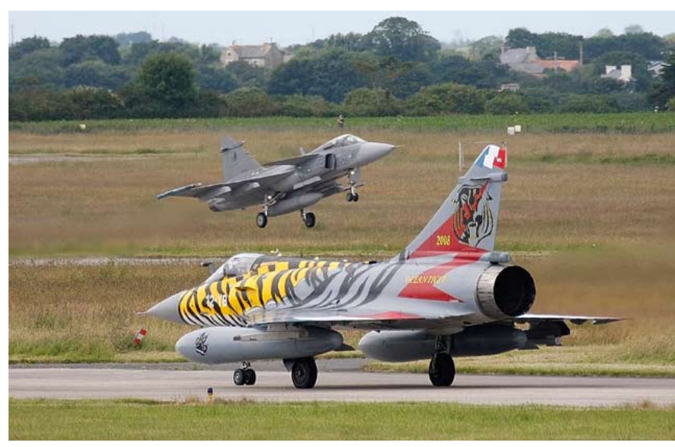
French Mirage 2000 on taxiway in front of Czech JAS-39C Gripen taking off.

On the island, just off the south-western coast of the Bretagne, personnel of the United Nations were captured by hostile troops. The Special Forces are tasked to free the hostages and evacuate them. In NATO phraseology