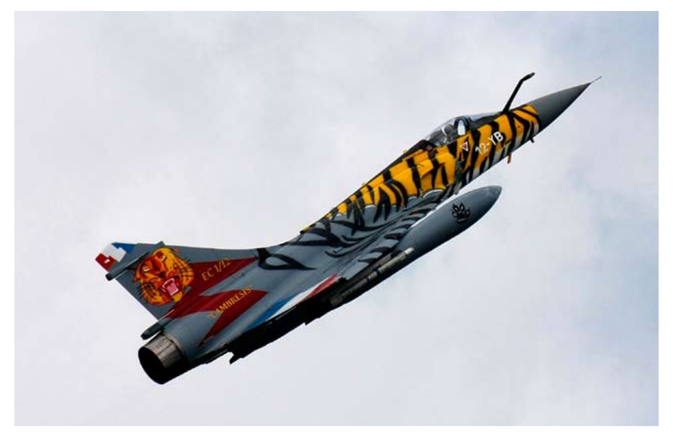
Mirage 2000 from Escadron de Chasse (EC) 01/12 at Cambrai.