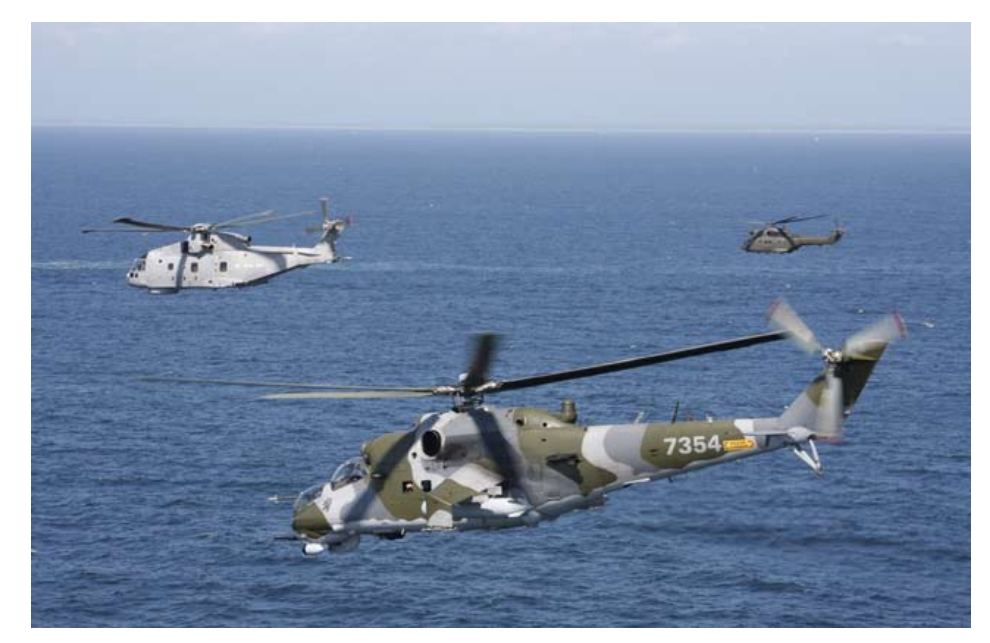
Target-Approach over water - Czech Mi-24 Hind in front of Merlin (left) und Puma Helicopters.