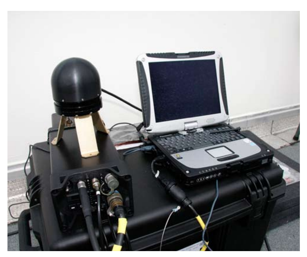
ROVER 4 (Remotely Operated Video Enhanced Receiver) Receiver Antenna and Laptop.

was really impressive to see how the squadron managed to organize the Meet in such a short timeframe. Never before have we had 80 missions flying on a single day at Landivisiau. It was a brand new experience on the flying as well as the logistics part. Of course we had excellent planning support from Kleine Brogel and Cambrai, but at the end we had to cover it all on our own. Nobody in the squadron complained about the long working days during the preparation of NTM 08. Everybody in the squadron had the same goal, to make "NATO Tiger Meet 2008" a success.