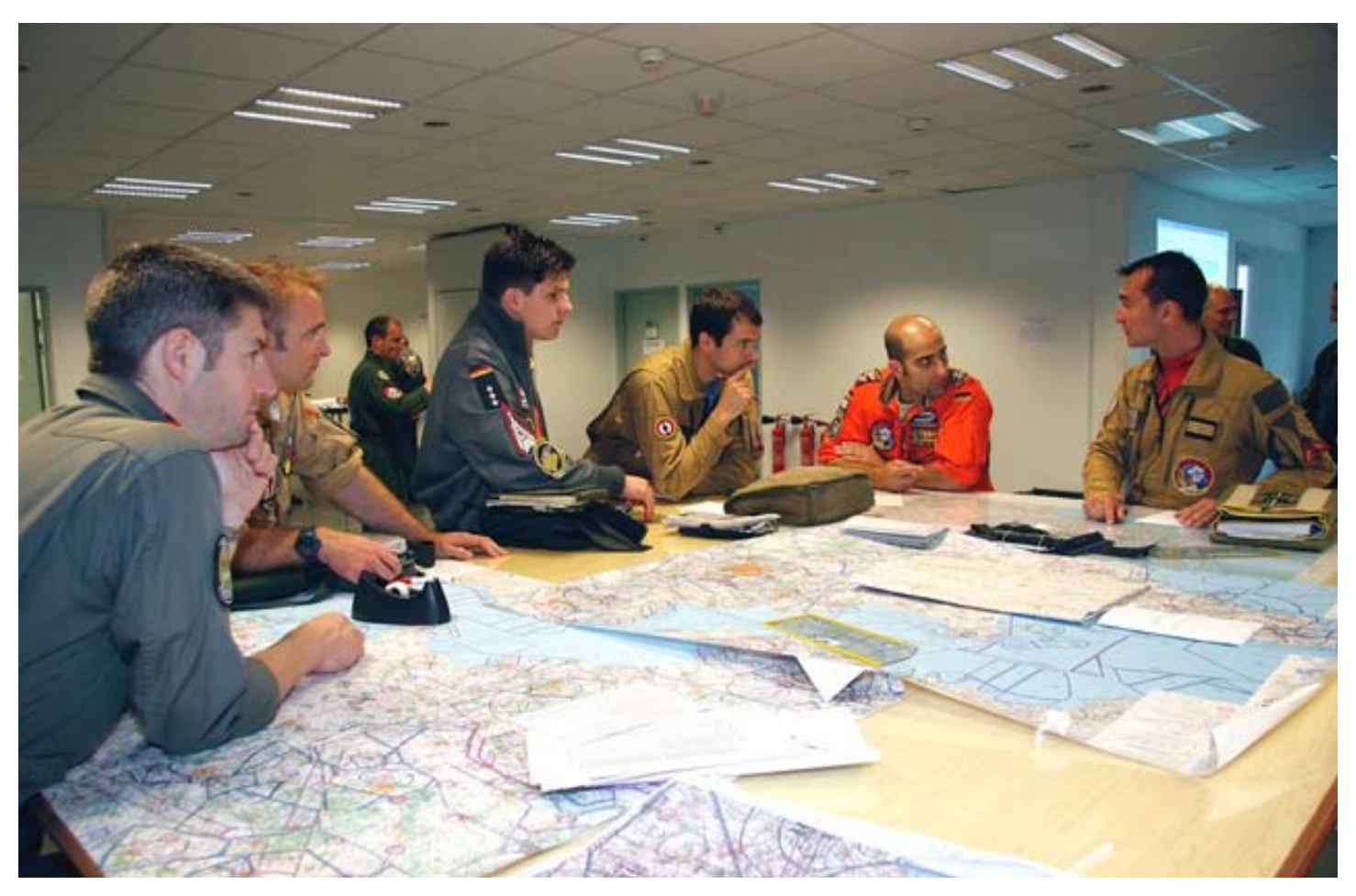
Aircrews from various nations are planning a COMAO.

High value training – For young aircrews the Tiger Meet is something special and new. Besides tigered flight scarves, colourful aircraft, and the famous tiger-traditions (which they already know about within their own sqdns), it is for many their first time to attend a multinational exercise. That was the case also for Cap-