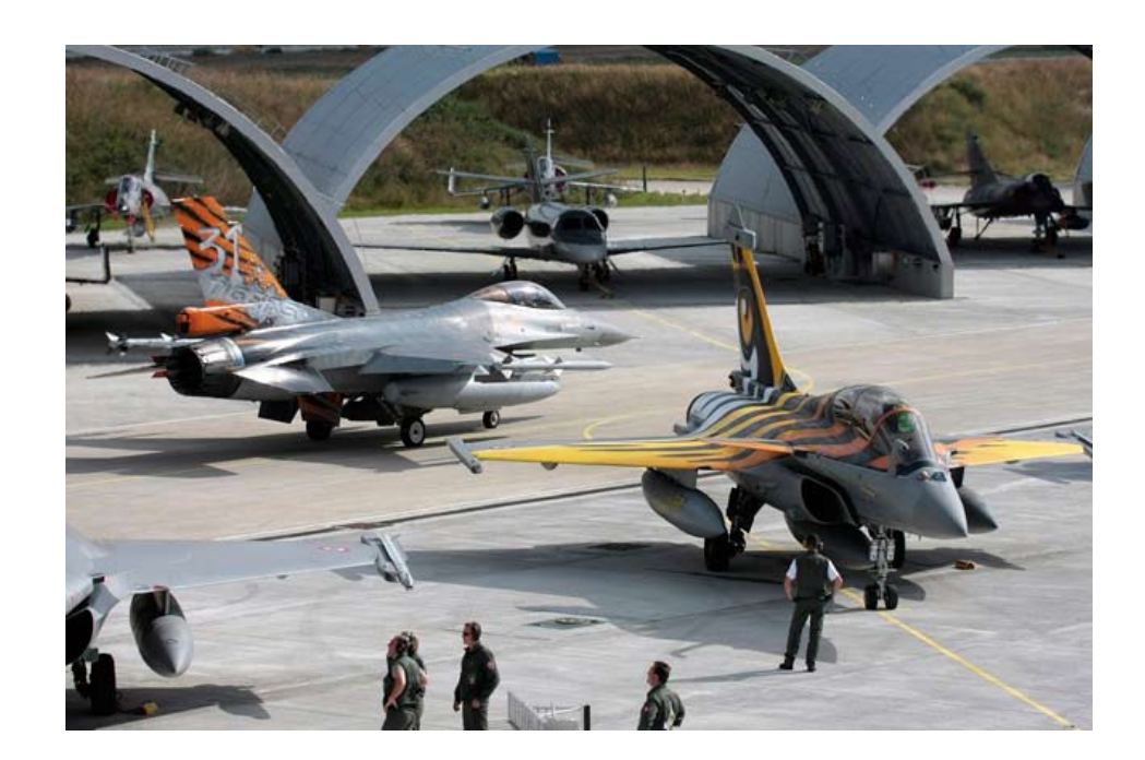
Belgian F-16 and French Rafale on the apron.

Landivisiau – 14 flying squadrons from 8 nations met at the end of June on the French Navy Base 30 kilometers northeast of Brest. Almost 500 pilots and technicians with 36 aircraft and 8 helicopters visited the French Navy. In addition observers from Italy, Norway and Greece were present, but did not play a part in flying operations. During 5 exercise-days Composite Air Operations (COMAO) were flown on a daily basis with sometimes more than 40 aircraft airborne. Different forces had to work together. Fighter and recce aircraft, bombers, CSAR-helicopters (Combat Search and Rescue) and one E-3A NATO Early Warning Aircraft from 1 Squadron Geilenkirchen / Germany flew complex mis-