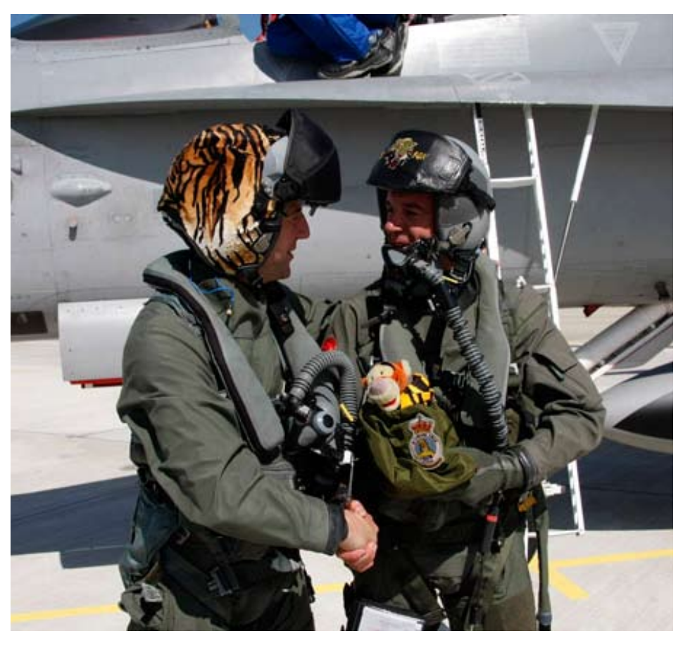
Pilot of 31 Squadron thanks the Swiss Detachment Commander for taking the Mascot "Tijgetje" with an F/A-18 Hornet up into the French skies.